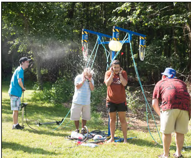
Camp Merry Heart Service Day...A great way to cool off.